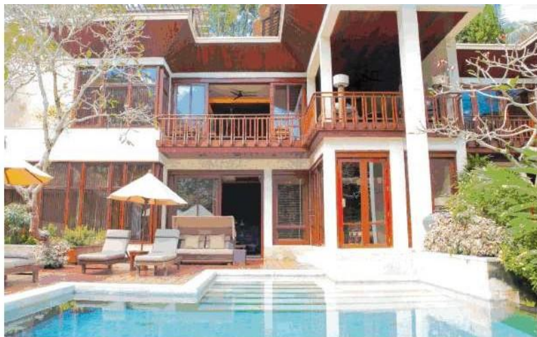
Top and top right: Villa Maria. Left and below left: Bayu Gita Beachfront. Above: The Royal Villa.